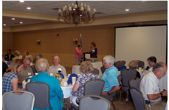
Members at Annual Meeting 2012

NOW IS THE TIME TO GET INVOLVED! DO YOU HAVE COMPUTER SKILLS? WE NEED A REPLACEMENT FOR THE DATABASE MANAGER.